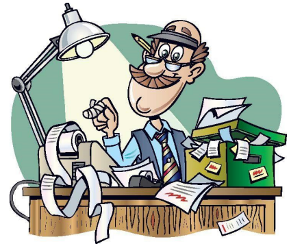
PAC Offerings 2021